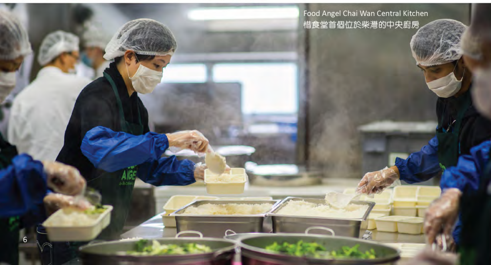
Food Angel Chai Wan Central Kitchen 惜食堂首個位於柴灣的中央廚房